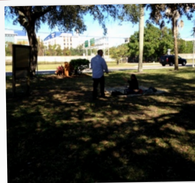
THIS IS THE PARK THAT WE SOMETIMES GO TO, THE HOMELESS SLEEP HERE ON THE WEEKEND