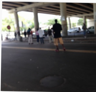
THIS IS THE UNDER-PASS, WHERE WE OFTEN GO TO MINISTER