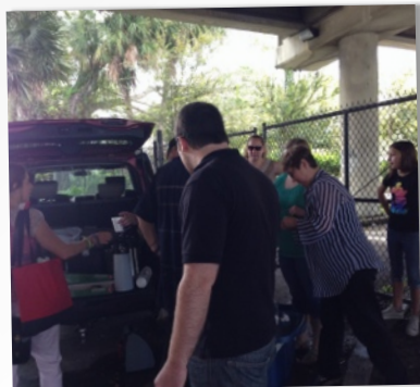
SUNDAY COFFEE AND DONUTS MINISTRY

The care packages were a hit and we actually ran out of them that morning that we distributed them. So please keep this ongoing homeless ministry in your prayers.