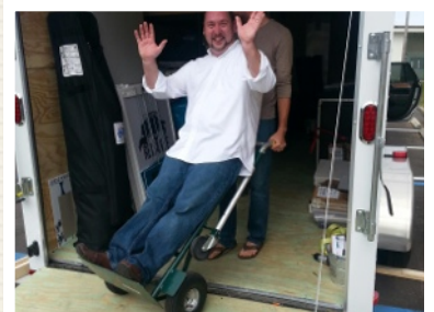
11:30 LOAD THE TRAILER