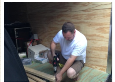
07:00- ALWAYS SOMETHING LAST MINUTE TO FIX