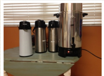
08:00- MAKE THE COFFEE