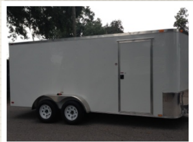
09:30 TRAILER ARRIVES- UNPACKING BEGINS